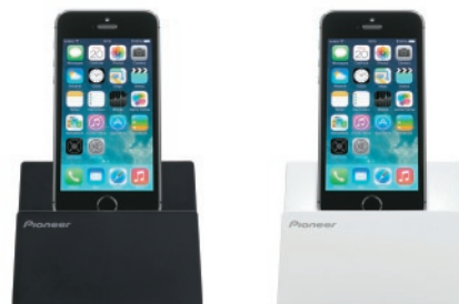
iPod/iPhone/iPad stand (same colour as the main unit) included