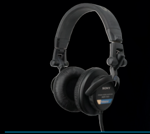
MDR-7505 Studio Headphones