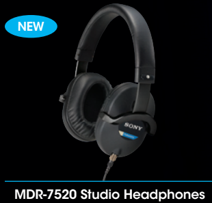
MDR-7520 Studio Headphones