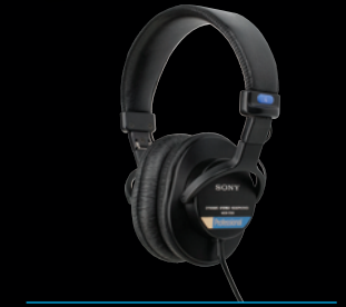
MDR-7506 Studio Headphones