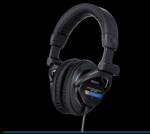
MDR-7509HD Studio Headphones