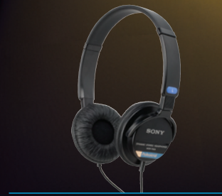
MDR-7502 Studio Headphones