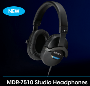
MDR-7510 Studio Headphones