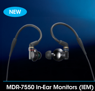
MDR-7550 In-Ear Monitors (IEM)