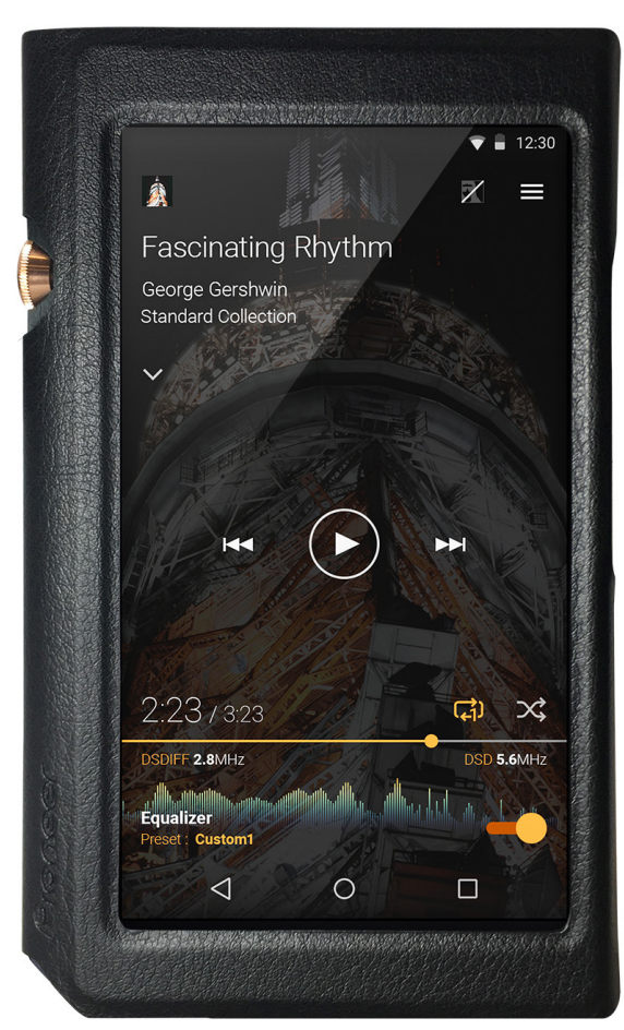
Image shows XDP-300R Digital Hi-Res Audio Player inside the XDP-APU300 Case. XDP-300R is not included .

The XDP-APU300 is designed to keep accessibility of button operations and terminals while protecting the edge of the main body and the SD card slot.